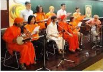
RAWA Taipei-Wenshan Unit