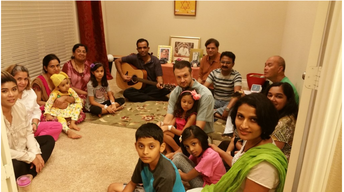
Image from Houston unit's Prabhat Samgiit celebrations held on Sept 12th.