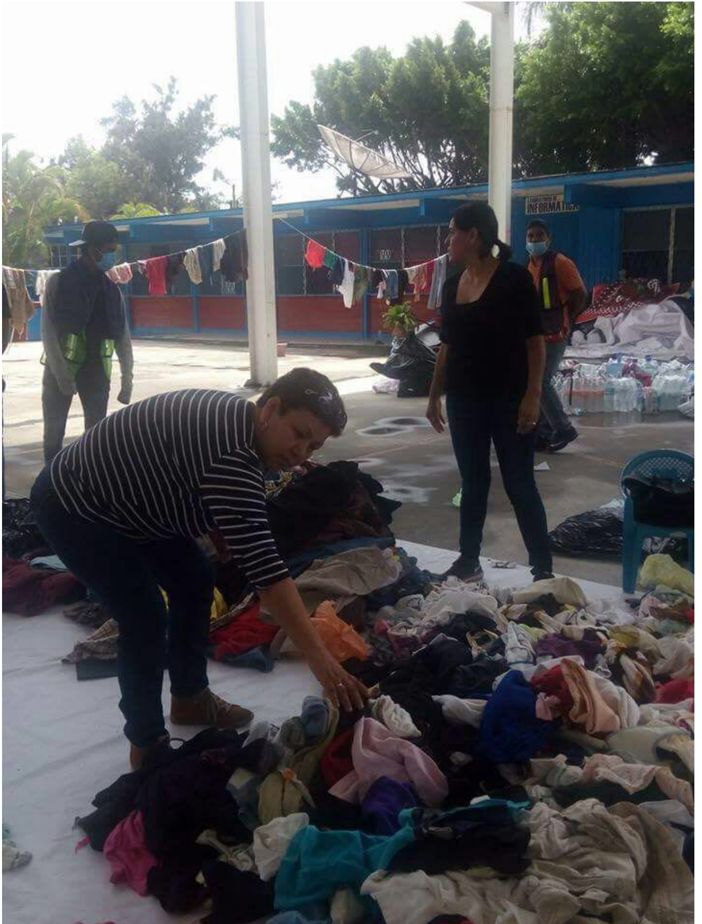
The cloths are sorted and washed before being delivered to the communities in the State of Morelos.