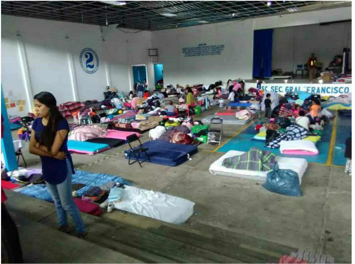
Temporary shelter which have received a donation of mattresses, bed sheets, blankets and clothing from Ananda Marga.